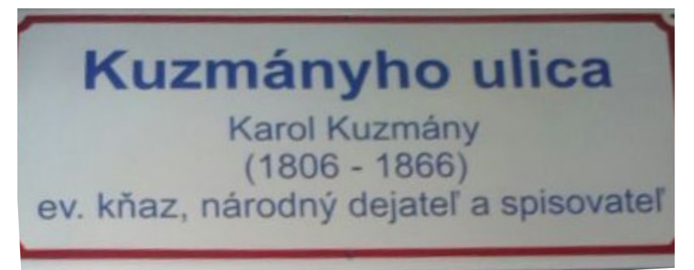
Figure 3. New dedication-type street sign (K. Kuzmány)