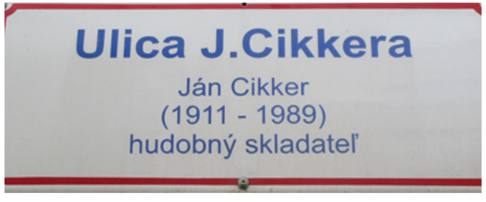
Figure 2. New dedication-type street sign (J. Cikker)

encyclopaedic information in a foreign language as well (probably English) to facilitate communication with foreign tourists.