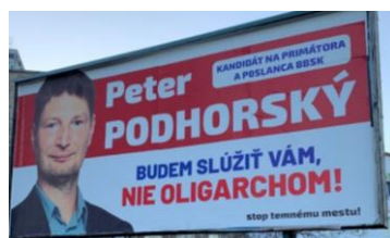
Figure 2 Nové Kalište2 in BB Source: Author's own archives (March 2023)

The counterpart of billboard 1 (Fig. 1) is billboard 2 (see Fig. 2), which is placed on the opposite side of the carrier (sign) and was still available in March 2023 as a reminiscence of the pre-election period in order to address the electorate of the municipal elections. As in the previous case, it addresses potential voters in a combination of graphics (a likeness of a candidate for mayor/member of the county with his/her name and surname) and text (proper nouns, candidacy, promise, appeal). Election promise "I will serve you, and not the oligarchs!" gives the recipients the idea that the current representatives of the city serve the oligarchs at the expense of the citizens of the city. This phenomenon is highlighted by the vague and unaddressed appeal "stop the dark city!" and we ask who is to "stop" the dark city? What makes it "dark"? Alleged cooperation with alleged oligarchs?