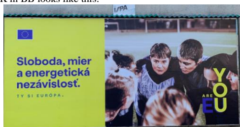
Figure 7 THK BB (2023)

The semiotic political linguistic landscape in March 2023 at the THK in BB looks like this: