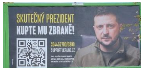
Figure 4 Billboard in Hradec Králové (Czechia, 2022)

An appropriate example of the impact of political language landscape on city participants is the billboard below (Figure 4) from Hradec Králové, Czech Republic, in March 2022, appealing for the purchase of arms for UA. In addition to the image of the Ukrainian president casually dressed in khaki colours (thus referring to the state of war in his country), the appeal text ("The real president. Buy him weapons!"), the banner includes a link to a website with an account number and a QR code for electronic payment. President Zelensky's own name is not mentioned on the billboard at all because it is assumed that he is so well-known that it is unnecessary. The billboard was placed in the city near the main train station by the activist civic association Let's Talk Together , to which the advertising company BigMedia rented commercial space for three months. About halfway through the lease, BigMedia had the billboard removed, arguing that the town's citizens had complained about the medium (Moláček, 2022).