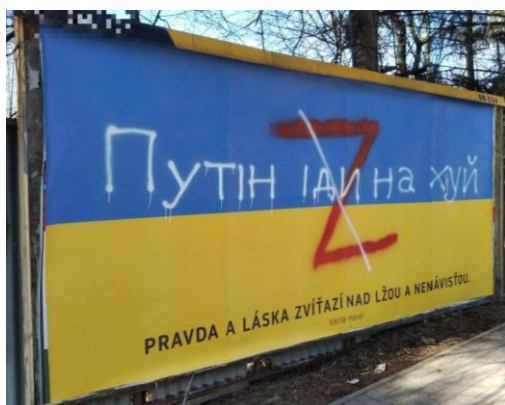
Figure 6 THK in BB (2022) with three message layers

However, this was not the end of the "communication" in LL at THK in BB. The anonymous author/group used the white colour to crossed out the red letter "Z" and wrote their message in Cyrillic directly addressing the Russian president (see Fig. 6), sending him to the place where, at the beginning of the war, the Ukrainian defender had sent the Russian warship. The previous quotation of an UA soldier became topical and contextualized similar way as the Havel' quote on Fig. 5. Both value and opinion clashes take place publicly on the ground of a publicly accessible medium fulfilling the role of a kind of public "bulletin board" providing enough space for passers-by to engage effectively due to its size, good readability, persistence of the message, etc.