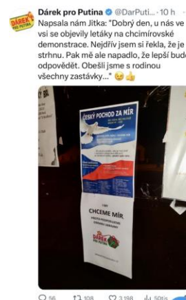
Figure 12 We want peace

Source: Dárek pro Putina, Twitter.com (13.3.2023)