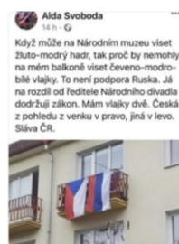
Figure 8 LL on Facebook

The author of the translated Facebook status above makes clear his clear value position through axiological (evaluative) expressions - "yellow-blue rag", "red-blue-white flags", "if it can...on the National Museum...why not on my balcony...", "it is not support", "glory to the Czech Republic" (Fig. 8).