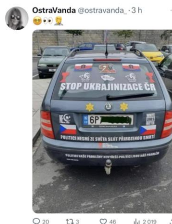
Figure 11 Mobile LL (car)

A tweet (i.e. a Twitter status) reacting to the political situation is shown in Fig. 11, which shows a mobile LL - a private car serving as signs carrier ("Stop the Ukrainisation of the Czech Republic", "Politicians must not leave the world by natural death", "White lives matter", etc.) and Czech flags. The car as a carrier would deserve a separate analysis in a separate study, not only with regard to the author's phobias (e.g. phobia against migrants and aid for them), but also death threats (to politicians), etc.