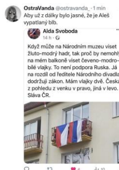
Figure 9 Twitter status

OstraVanda's Twitter profile sharply contradicts (14/3/2023) the status posted by Aldo Svoboda's profile (13/3/2023) by declaring "To make it clear from afar that Ales is a stupid moron" (fig. 9).