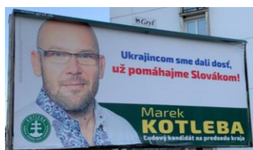
Figure 1 Nové Kalište1 in BB Source: Author's own archives (March, 2023)

The counterpart of billboard 1 (Fig. 1) is billboard 2 (see Fig. 2), which is placed on the opposite side of the carrier (sign) and was still available in March 2023 as a reminiscence of the pre-election period in order to address the electorate of the municipal elections. As in the previous case, it addresses potential voters in a combination of graphics (a likeness of a candidate for mayor/member of the county with his/her name and surname) and text (proper nouns, candidacy, promise, appeal). Election promise "I will serve you, and not the oligarchs!" gives the recipients the idea that the current representatives of the city serve the oligarchs at the expense of the citizens of the city. This phenomenon is highlighted by the vague and unaddressed appeal "stop the dark city!" and we ask who is to "stop" the dark city? What makes it "dark"? Alleged cooperation with alleged oligarchs?