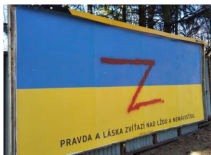
Figure 5 THK in BB (2022) with two message layers