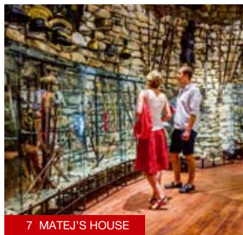
7 MATEJ'S HOUSE