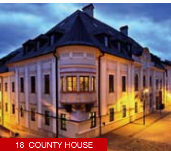
18 COUNTY HOUSE