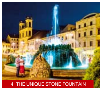
4 THE UNIQUE STONE FOUNTAIN