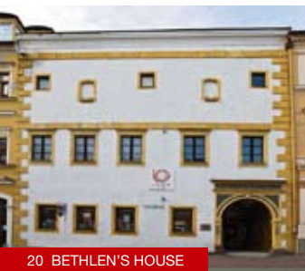
20 BETHLEN'S HOUSE