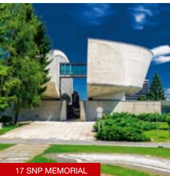
17 SNP MEMORIAL

20 Bethlen's house is known for the meeting of the Hungarian Diet in 1620 held in the house that named Transylvania Prince Gabriel Bethlen as the King of Hungary. Today the building is home to the Central Slovakia Gallery and hosts a wide range of exhibitions, primarily focused on modern and contemporary art. www.ssgbb.sk