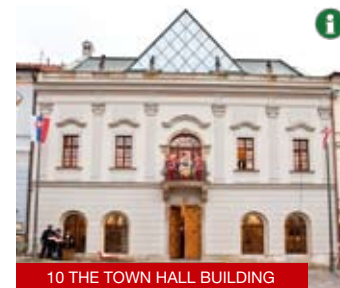
10 THE TOWN HALL BUILDING