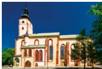
6 THE CHURCH OF THE VIRGIN MARY'S ASCENSION