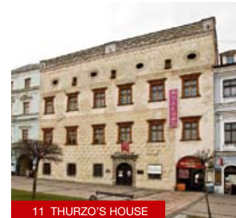
11 THURZO'S HOUSE